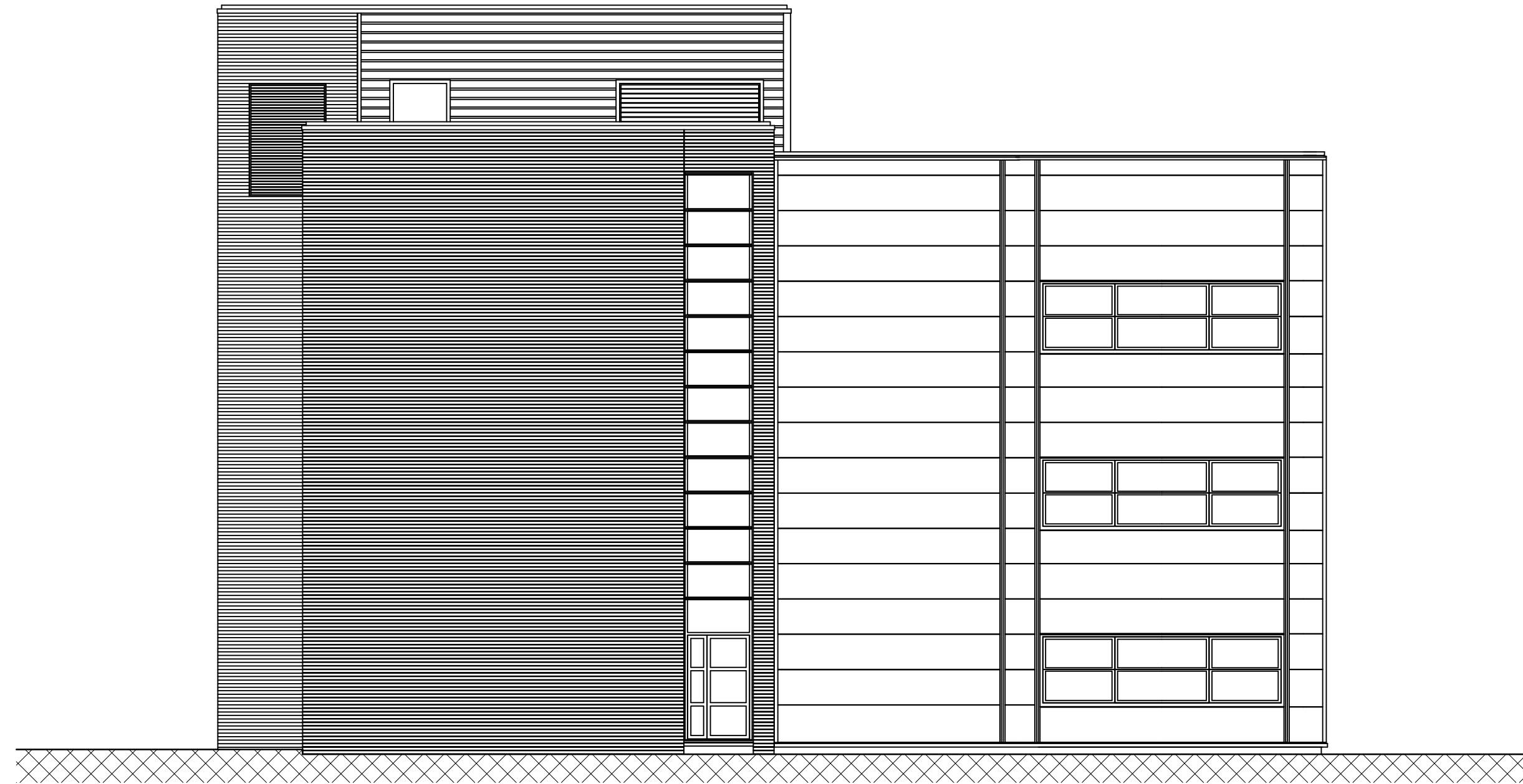
SOUTHERN ELEVATION. AS EXISTING SCALE 1:100.